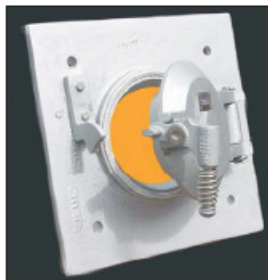
5 1/2" Round Door for balanced draft furnaces.