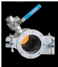
6" Diameter Observation Door for pressurized furnaces complete with aspirating air valve.