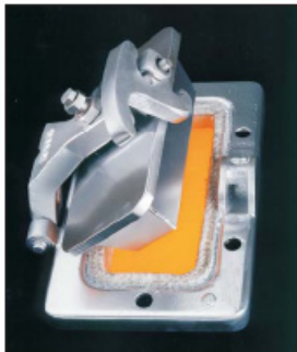
4" x 10" Door

Complete door and frame assemblies are in stock and available with a left or right hand opening option. Refractory lined stainless steel retainers are available to maintain your existing doors.