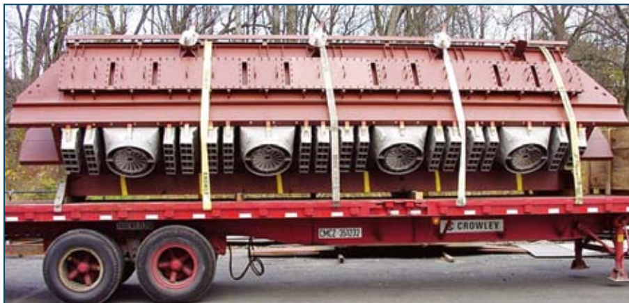
Replacement windbox for a 450 MW oil-fired unit