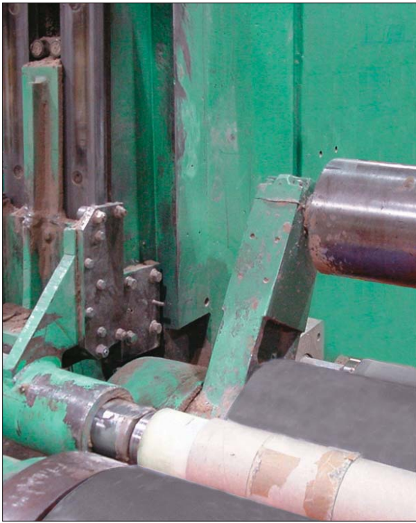
Core Chucks Before Repair