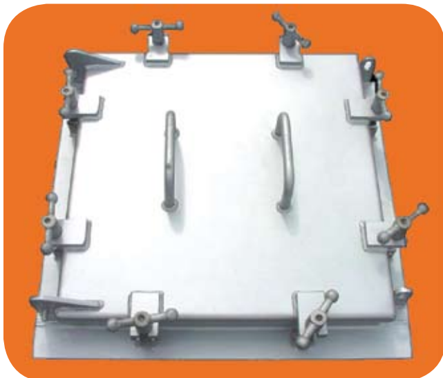
Our Hinged Access Doors are designed for left or right hand openings. Standard sizes include 18" x 18", 18" x 24", 18" x 40", 18" x 54", 24" x 24", and 24" x 48". Custom sizes are also available.