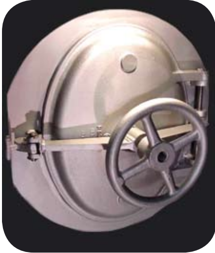
Our 15" x 21" Cast Elliptical Door is a direct replacement for your round OEM door.

R-V offers a variety of access door sizes and styles. All are available with optional seal box and tube panel for new furnace door locations. Our access doors make for great OEM replacements, and include left or right hand opening options, and self-cooling technology.