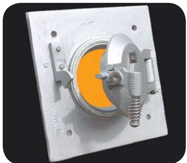
5 1/2" Round Door for balanced draft furnaces