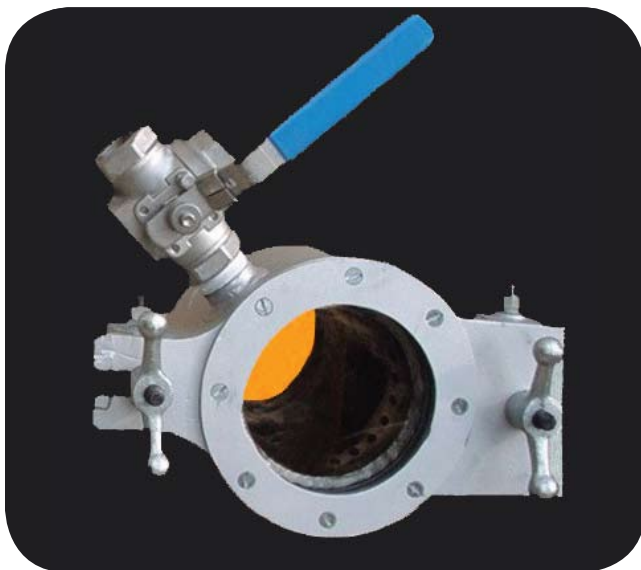
6" Diameter Observation Door for pressurized furnaces complete with aspirating air valve