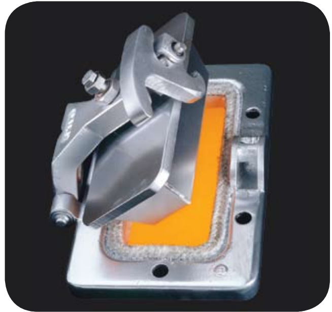
4" x 10" Door

Complete door and frame assemblies are in stock and available with a left or right hand opening option. Refractory lined stainless steel retainers are available to maintain your existing doors.