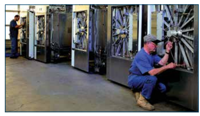
Sterilizer Final Assembly