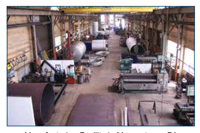
Manufacturing Facility in Morgantown, PA