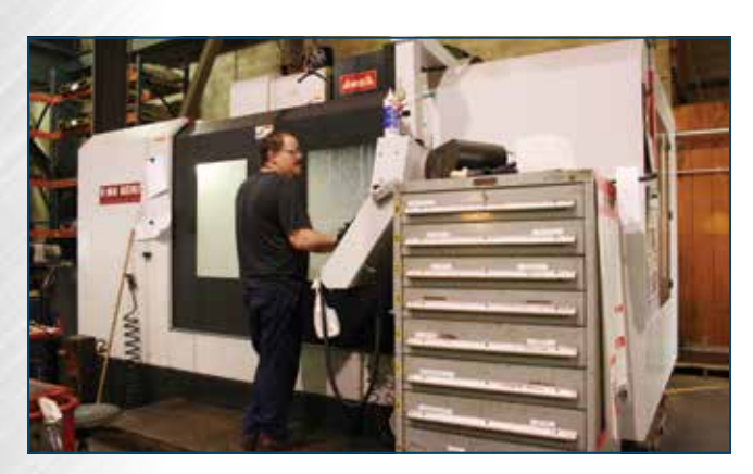
Vertical Machining Center