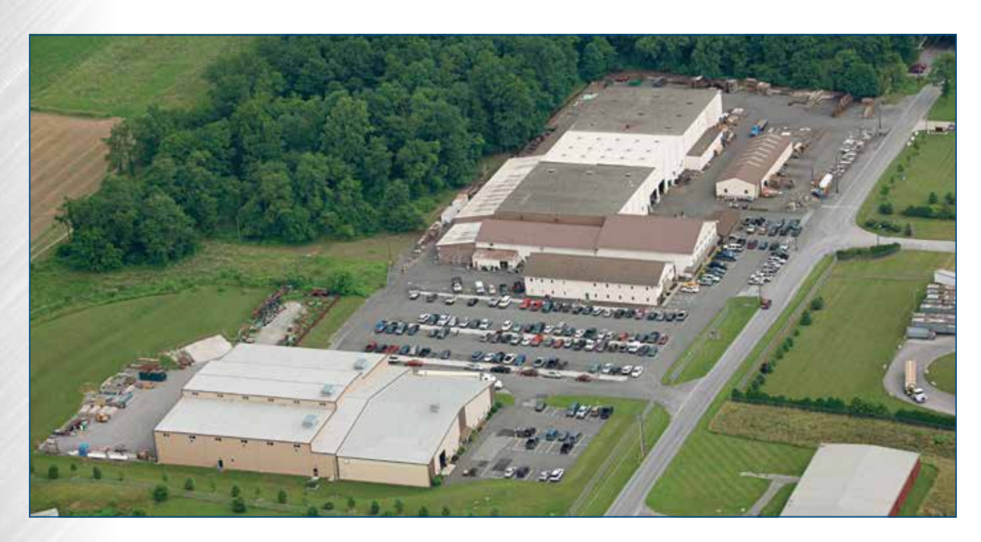
Honey Brook Manufacturing and Corporate Headquarters