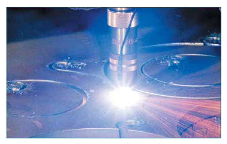
Plasma Burner in Operation