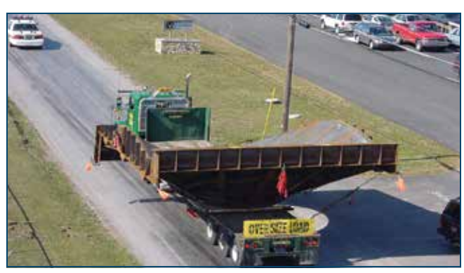
Oversized Load With Police Escort