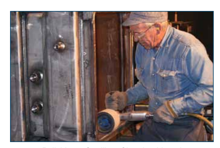
Polishing a Sterilizer Chamber Vessel