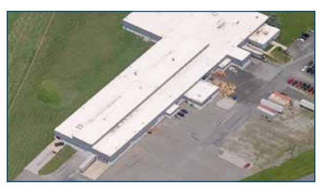
Honey Brook Manufacturing and Warehouse Facility