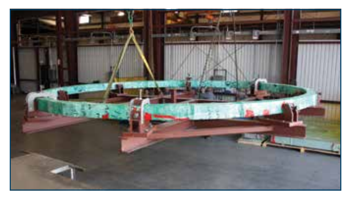
Overhead Cranes Lifting 20' Fabricated Ring