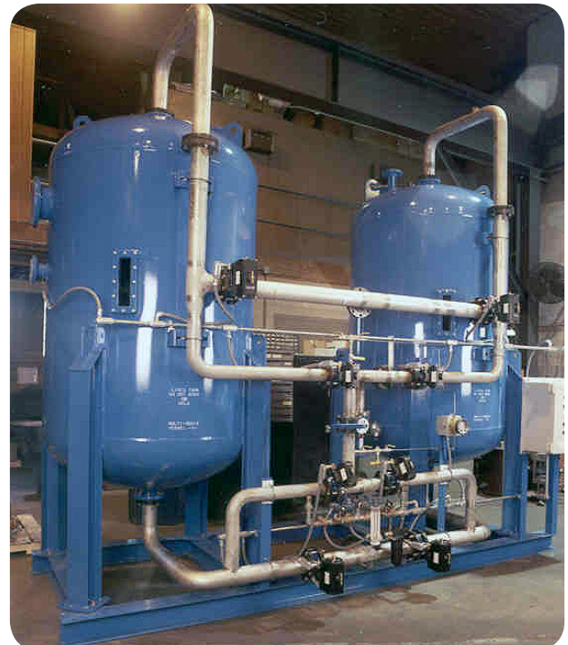
Wastewater Treatment Skid