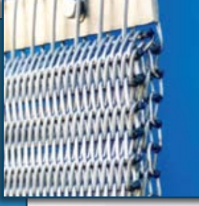
Dual Layer Design