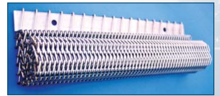
Screen Rolled for Hopper Maintenance