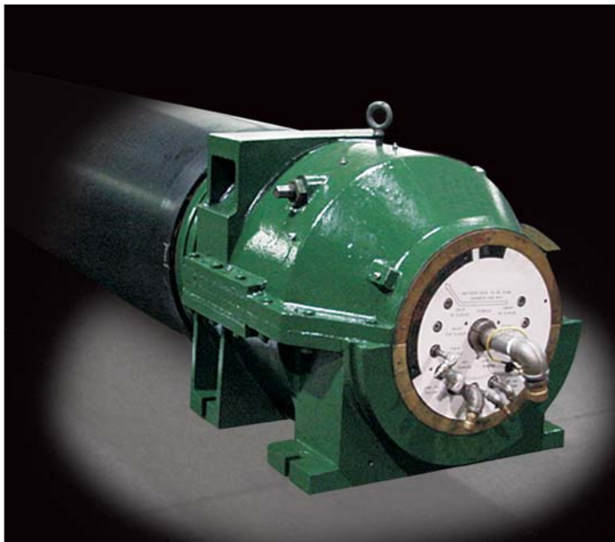
Suction Roll After Overhaul