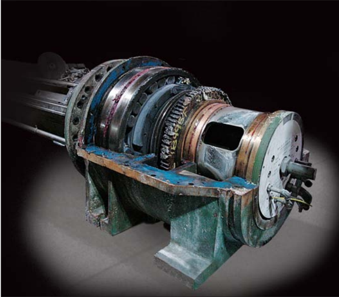
Suction Roll Before Overhaul