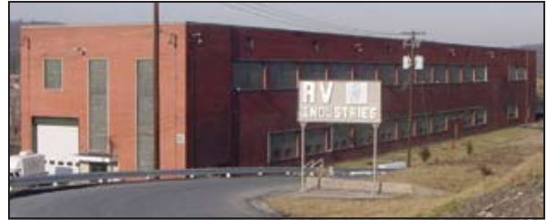
Morgantown Manufacturing Facility