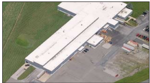
Honey Brook Manufacturing and Warehouse Facility