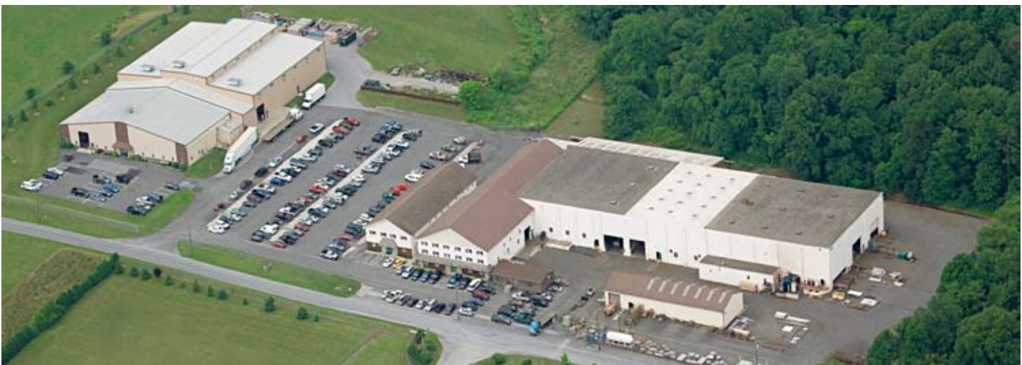
Honey Brook Manufacturing and Corporate Headquarters